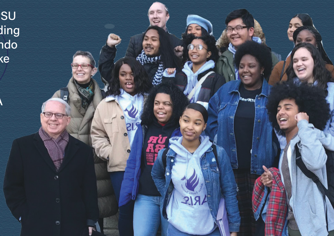
Image: ARISE & PSU youth activists leading the Cook v Raimondo legal fight to make education a constitutional right in the USA